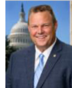
Senator Jon Tester