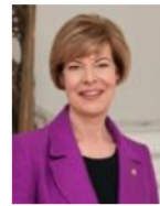
Senator Tammy Baldwin