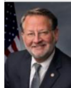
Senator Gary Peters