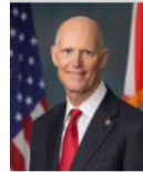
Senator Rick Scott