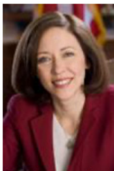
Chair Maria Cantwell