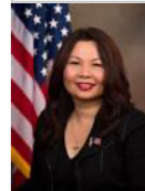
Senator Tammy Duckworth