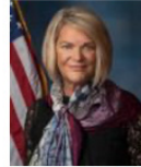
Senator Cynthia Lummis