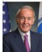
Senator Ed Markey