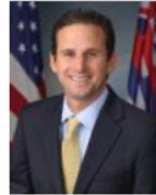
Senator Brian Schatz