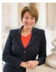
Senator Amy Klobuchar