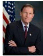
Senator Richard Blumenthal